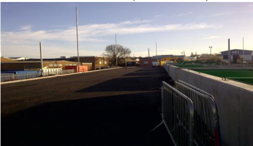
Household Waste (customer side)