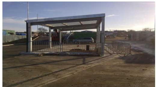
Canopy area (Oil, Paint etc.)